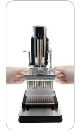
Hold Shell frame grid (Not provided) with both hands and lift it up in the direction of the Nd magnetic rod until it clicks.