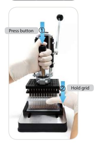
Press 'Tip removal button' while holding Shell frame grid with the other hand.